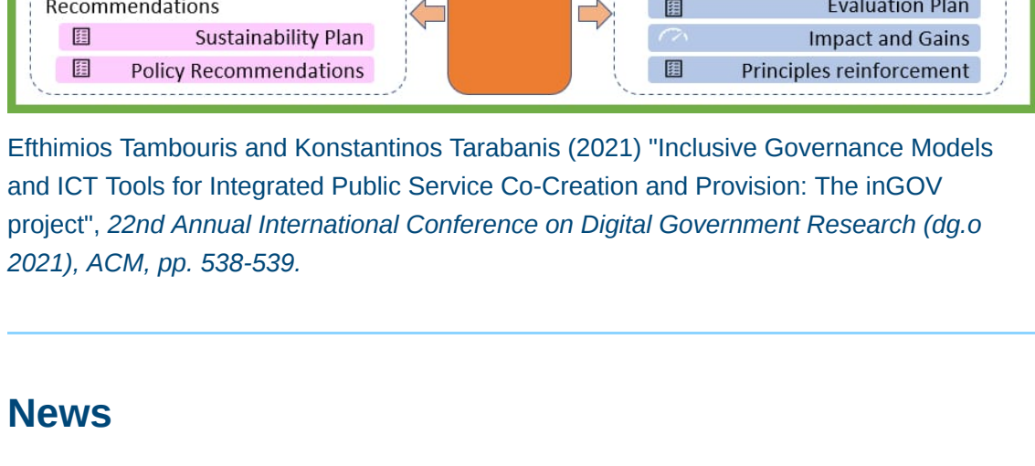
Efthimios Tambouris and Konstantinos Tarabanis (2021) "Inclusive Governance Models and ICT Tools for Integrated Public Service Co-Creation and Provision: The inGOV project", 22nd Annual International Conference on Digital Government Research (dg.o 2021), ACM, pp. 538-539.

The project begins with the enhancement of existing EU IPS models with co-creation aspects, then we proceed with constructing a Holistic Framework providing practical guidelines to practitioners, which is supported by constructing a relevant reference architecture and ICT tools. It follows piloting and evaluating the inGOV framework and ICT tools in four European countries: Austria, Croatia, Greece and Malta. Finally, it is planned to feed our findings back to policy. The figure below captures our approach.